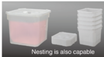
Nesting is also capable

Armored Container Made of Plastic which is able to Store STERITAINER with Content Liquid by Stacking: Visibility has been improved by making transparent. Transportation between base-points is capable under the status of housing in a container.